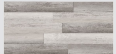
► Variation on dark and light colours gradation.