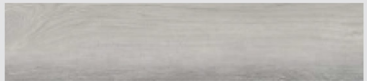
(Light colour part)

Size: 177.8mm x 1220mm Thickness: 3mm Packing: 15 pcs (3.25m 2 /box)